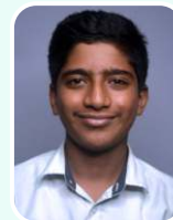
Jasrang Class IX B

Imagine living in a world where the blue ocean and the red sky at dawn appear to be the same colour. For a large section of the population, this is not imagination but reality. This inability to distinguish between certain colours is known as Colour Vision Deficiency (CVD), more commonly called colour blindness. It is not a disease or an abnormal condition, but simply a different way in which some people see the world.